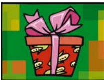
Zawadi - the gifts