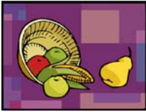
Mazao - the crops