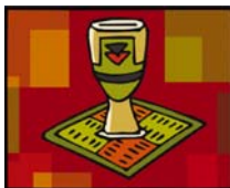
Kikombe cha Umoja - the unity cup